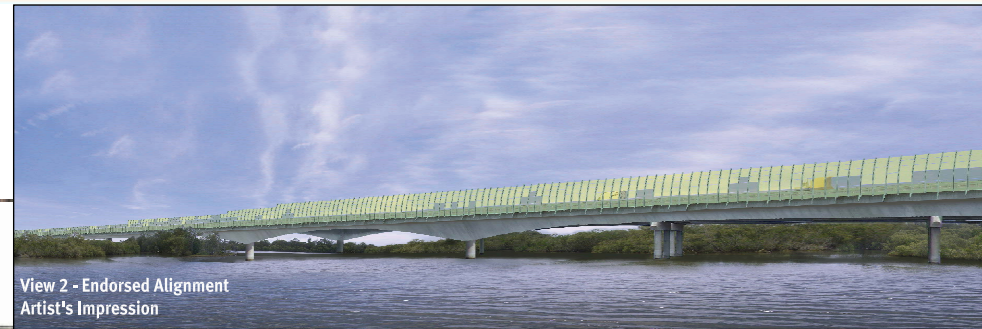
View 2 - Endorsed Alignment Artist's Impression