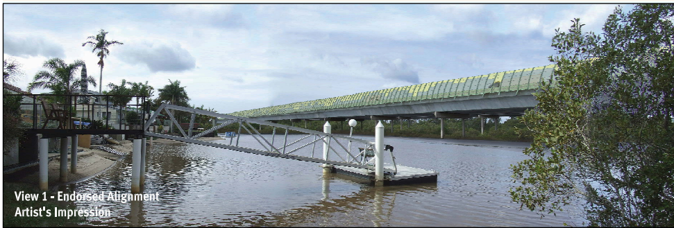
View 1 - Endorsed Alignment Artist's Impression